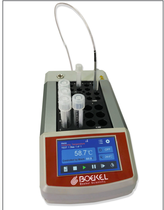
Two Block Unit with External Temperature Probe