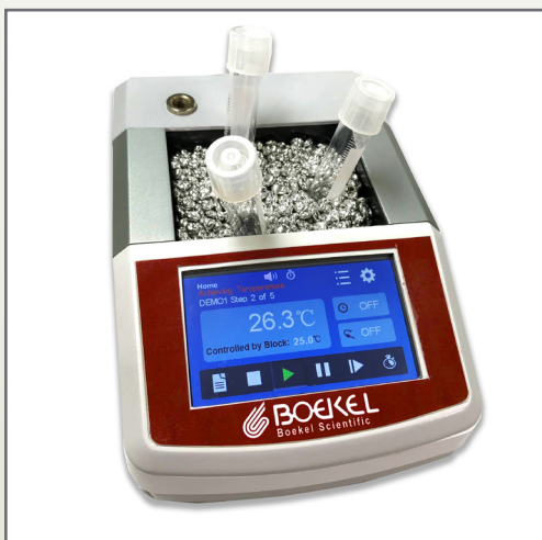
One Block Unit with Thermal Beads